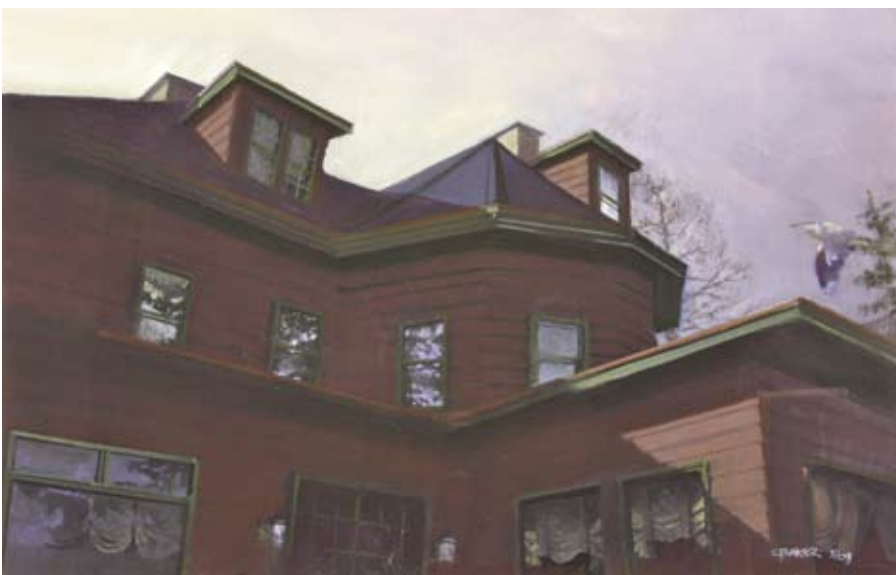
CHRIS BAKER, HERON OVER THE BREWSTER, GOUACHE, 14 X 20"

“In my technique, the results emerge slowly after many studio sessions of patiently applying pencil strokes to paper,” says Wesner. “I use light pencil pressure to build layer upon layer of color for a luminous effect.” ●