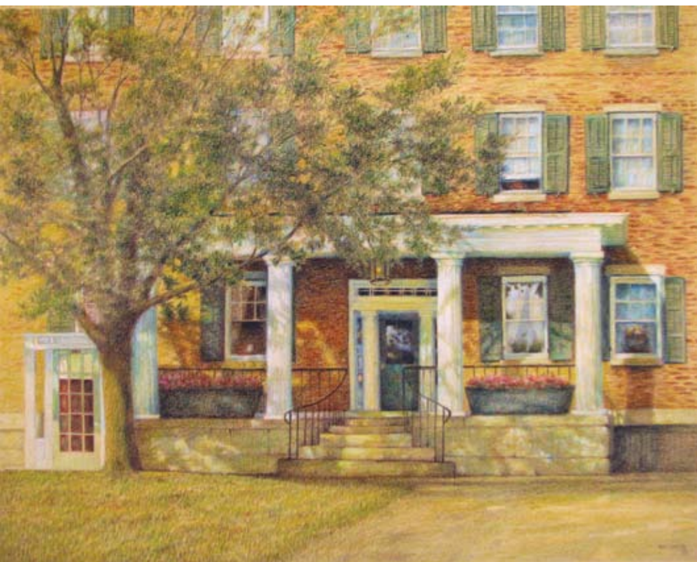
LINDA WESNER, TRAVELLING LIGHT, COLORED PENCIL, 16 X 20"

Baker. "Searching for unique points of artistic view, I discovered that often a smaller, more intimate vision spoke more clearly of the village's character. A corner of a historic inn on the lake with a heron flying overhead spoke to me of the past, present and even the future. As with any form of art, the visual investigation of a subject reveals much more than a visual diary."