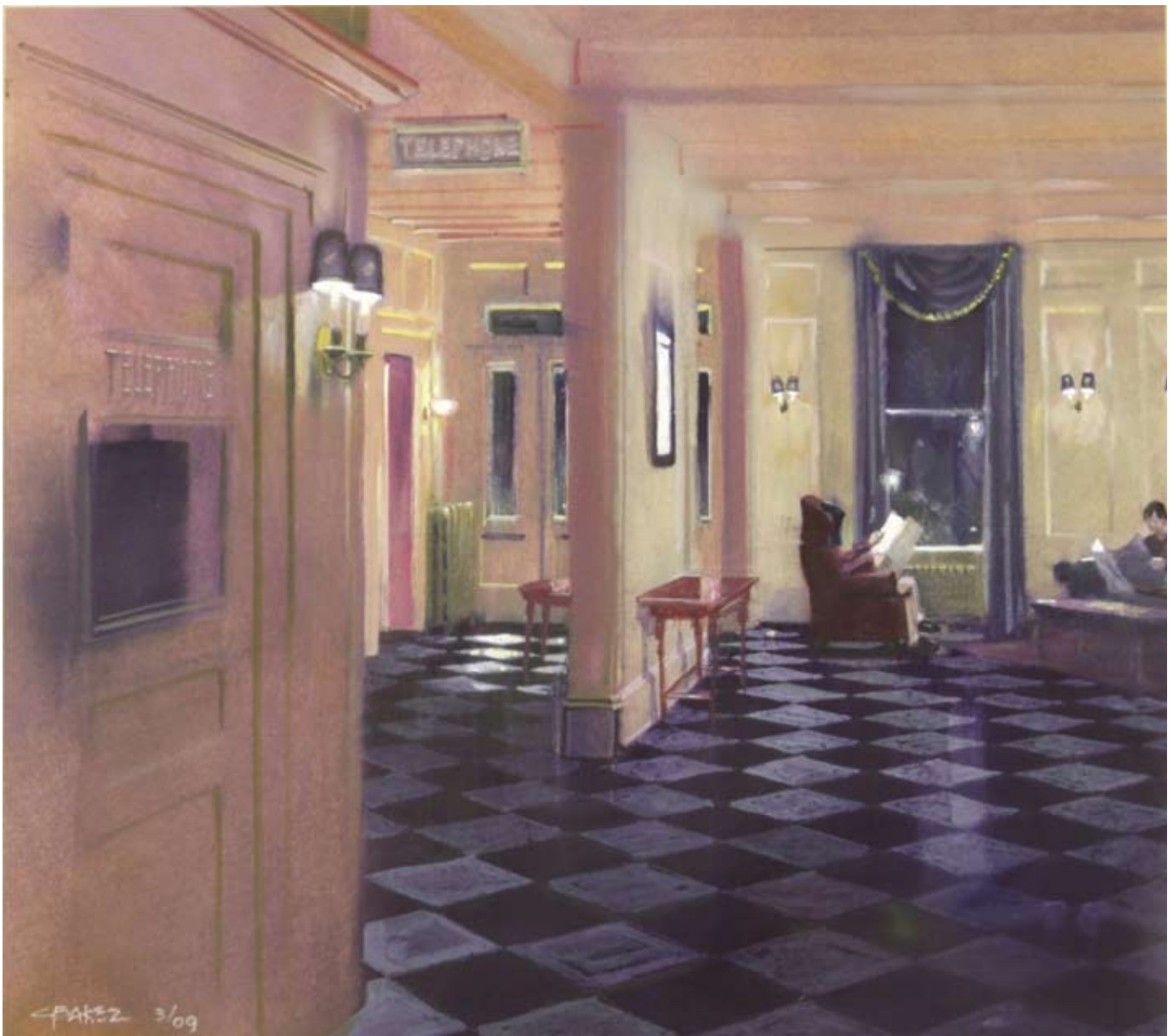
CHRIS BAKER, EVENING NEWS, GOUACHE, 11½ X 13"

local sites. Seeing the area from both 'inside and out' was revealing: buildings, landscapes and interiors. I found that there was a small town feel but with an obvious rich historical past, both evident upon driving through the village," says